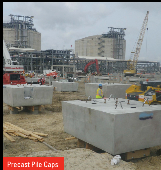
Precast Pile Caps